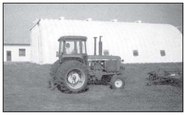
Figure 2: The tractor cab is an example of isolating a person from a noise source.

Ear plugs are small, soft inserts placed into the outer ear canal. They must totally block the ear canal with an air tight seal to be effective. Plugs are