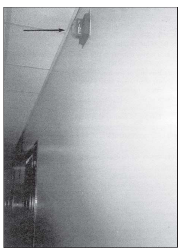
Figure 4: Strobe lights on fire detectors flash when the alarm is activated.

In addition to hearing aids, the following are a few of the many personal aids available. Neckloops are worn around the neck for use with a hearing aid T-coil. The neckloop has a plug that can connect to the output jack of a personal receiver, a television set, a radio, or other audio instrument. Some alarm clocks flash a strobe light or vibrate your pillow or bed to signal, "Time to wake up!" Phone call signalers alert you of an incoming call by flashing a lamp on and off. Closed captioning decoders print a TV program or videotape's dialogue and sound effects on the TV screen, similar to subtitles