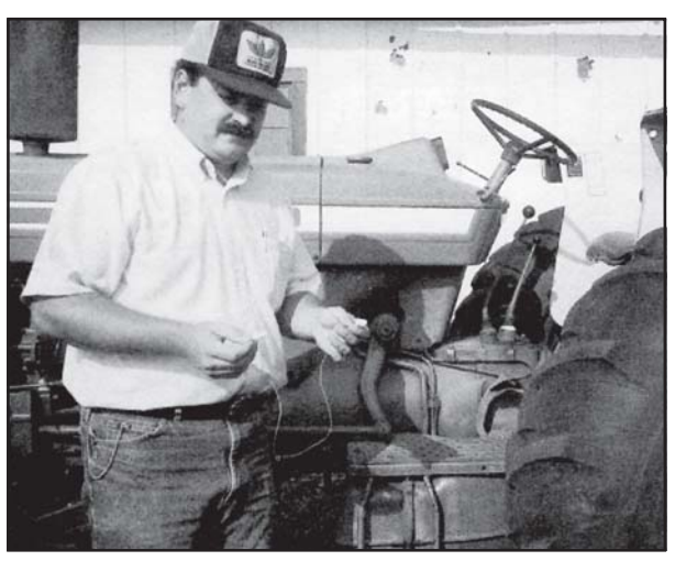
Figure 3: Ear plugs are an efficient means of safeguarding against noise-induced hearing loss.

available in many shapes and sizes to fit individual ear canals and they can be custom made (Fig. 3).