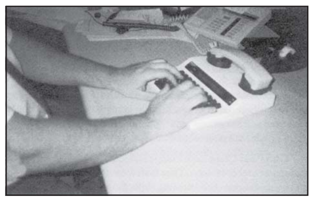
Figure 5: Individuals with speech impairments can also use text telephones (also known as TTYs or TDDs) to communicate by telephone.

Farmers who have a hearing impairment will need more than technology to accommodate their loss of hearing. They will also need to develop accommodating work strategies for the farm.